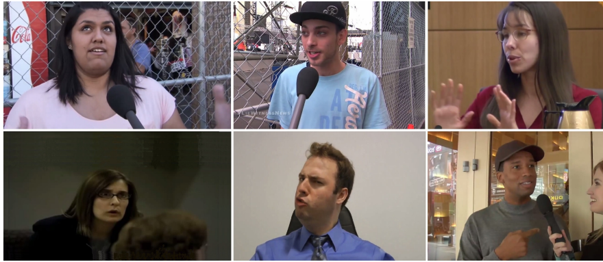
Figure 1: Sample screenshots showing facial displays and hand gestures from real-life deception and truthful clips. Starting at the top left-hand corner: deceptive interview with up gaze ( Up ), deceptive interview with side gaze ( Side ), deceptive trial with both hands ( Both-H ), truthful trial with forward head ( Forward ), truthful interview with side turn ( Side-Turn ), and truthful interview with single hand ( Single-H ).